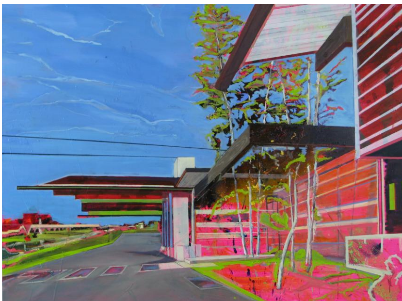
Pappenfort Residence with Birch Trees Oil, Acrylic & Coloured Pencil on Canvas 36" x 48" 2008