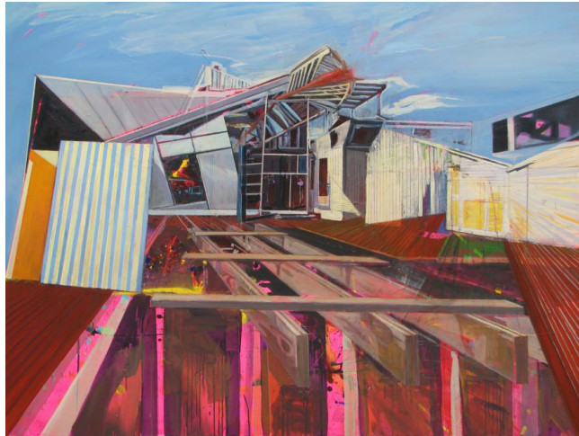
Bending and Tension, fig. 3 Oil, Acrylic & Coloured Pencil on Canvas 54" x 72" 2008

spaces that reflect synthetic environments. In my work, Bending and Tension (fig. 3), I use overlapping shapes and architectural forms to develop a space that references a suburban or commercial dwelling. The space looks artificial and lacks a reference to the natural world,