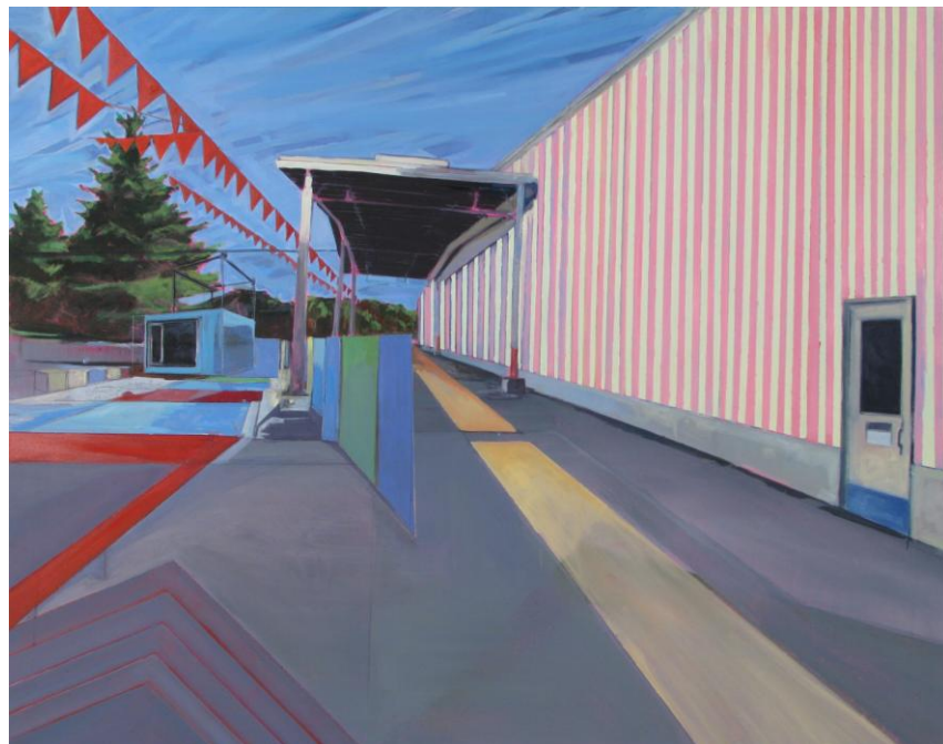
Modular Units Oil, Acrylic & Coloured Pencil on Canvas 48" x 60" 2007