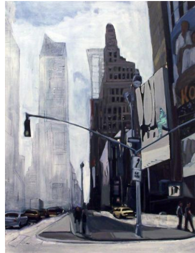
The Conversationalist , fig. 1 Oil on Canvas 48" x 36" 2006

In many of my earlier works, such as The Conversationalist (fig. 1), I explored Soja's concepts about tensions and energies within the urban environment. A tension is created between the visible buildings in the foreground and the dissolving buildings in the distance, which can be seen as