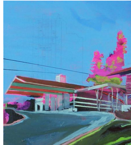
Pappenfort Residence (detail), fig. 6 Oil, Acrylic & Coloured Pencil on Canvas

right of the painting. The viewer is able to complete the fragmented form as a car and identify it. Another example of fragmentation used in my work is in, Pappenfort Residence . As seen in the detail (fig. 6), I outline part of an apartment building in the background, which is sufficient for the viewer to assume the association of this shape as a building. I wish to engage viewers through these associations and draw them further into the work, creating an engineered simulated experience.