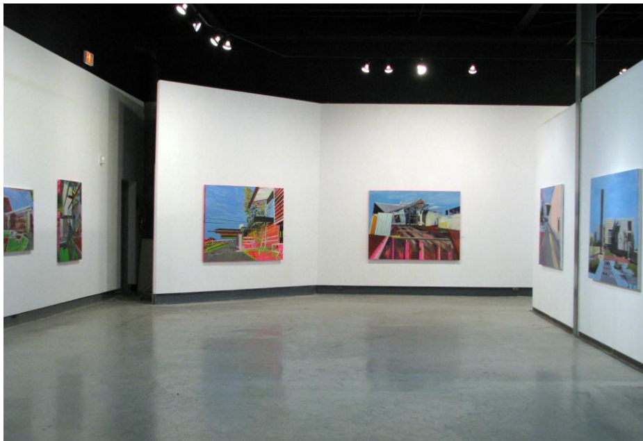
Installation Shot, Flat Places and Dynamic Spaces 2008