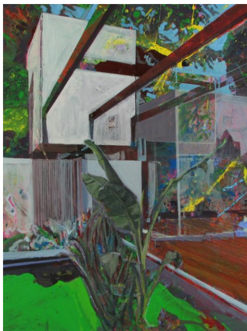
Inside Out Oil, Acrylic & Coloured Pencil on Canvas 48" x 36" 2008