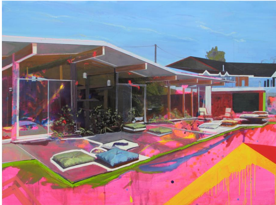
Leisurescape Oil, Acrylic & Coloured Pencil on Canvas 54" x 72" 2008