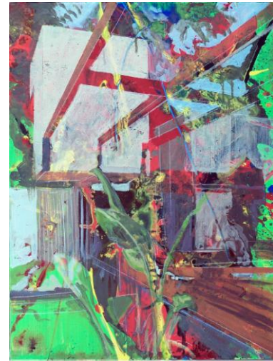
Inside Out, fig. 4 Oil, Acrylic & Coloured Pencil on Canvas 24" x 18" 2008

I use neon under-painting to represent a synthetic or artificial environment; an environment that looks engineered, plastic or imaginary. The colours also act as a device to attract the viewer's attention, as the brightness of the colours seem to