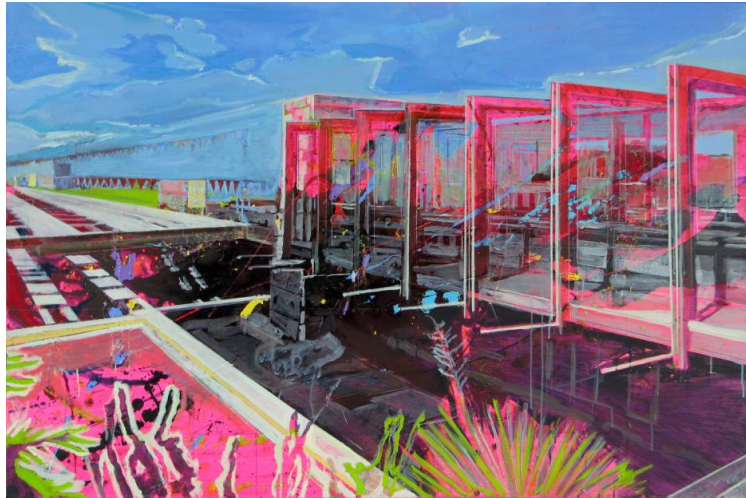
Upton Residence, fig. 10 Oil, acrylic & Coloured Pencil on Canvas 40" x 60" 2008

reach the horizon line they must work their way through the elongated and exaggerated composition. Along the way, viewers encounter skewed shapes, overlapping abstracted forms and patterns. The space depicted behind the