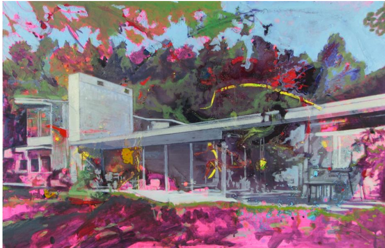
Robbins' Residence , fig. 8 Oil, Acrylic & Coloured Pencil on Canvas 24" x 36" 2008

and planes of colour as though it were an abstract painting. In my painting, Robbins' Residence (fig. 8), I incorporate the abstracted under-painting in the windows of the building and the trees