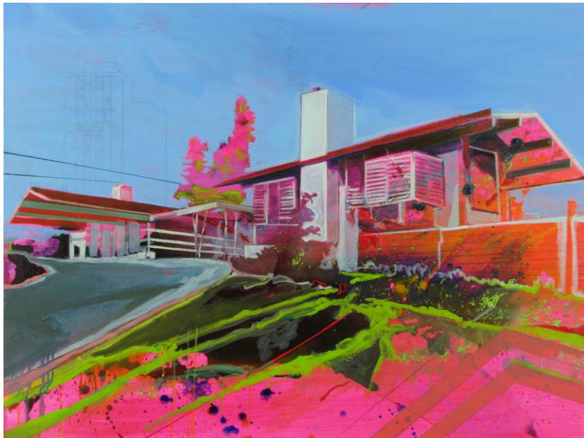
Pappenfort Residence Oil, Acrylic & Coloured Pencil on Canvas 36" x 48" 2008