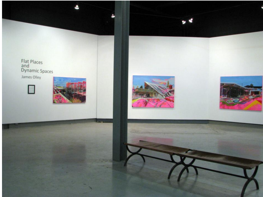
Installation Shot, Flat Places and Dynamic Spaces 2008