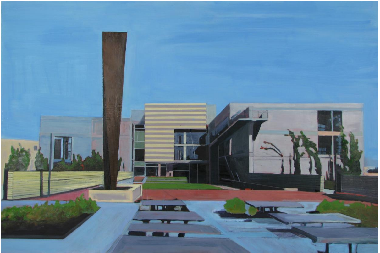
New Office Oil & Coloured Pencil on Board 48" x 72" 2007