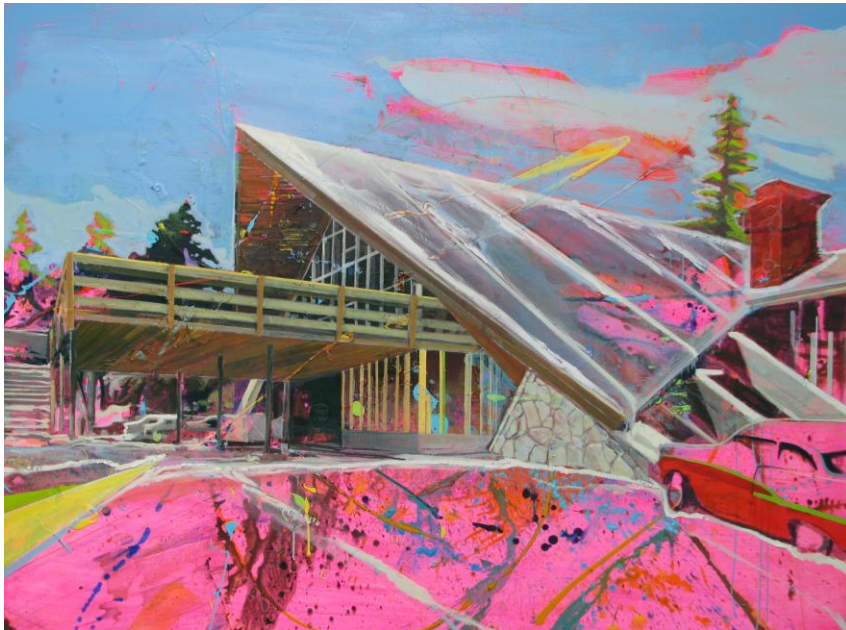
Mammoth Mountain Inn Oil, Acrylic & Coloured Pencil on Canvas 54" x 72" 2008