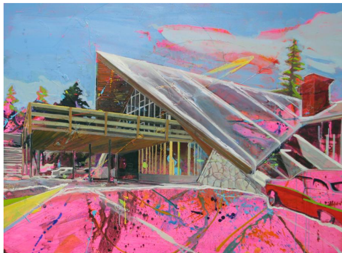
Mammoth Mountain Inn , fig. 5 Oil, Acrylic & Coloured Pencil on Canvas 54" x 72" 2008

I fragment images by making conscious decisions to omit or include parts of images used in my paintings. It is my intention that the fragments I choose to include will create an association with the viewer even though they are only seeing part of a whole or seeing these fragments in a constructed setting. As demonstrated in the work, Mammoth Mountain Inn (fig. 5), only the outline of the shape of the car is visible in the bottom