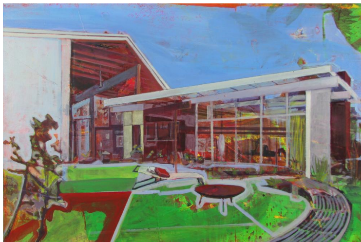
Haine's Residence, fig. 7 Oil, Acrylic & Coloured Pencil on Canvas 36" x 40" 2008

I eliminate all lighting sources, adding an element of ambiguity to my colour selection. As demonstrated in the painting, Haine's Residence (fig. 7), I often overlap projections enabling me to fragment